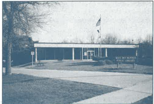
April 1966 - April 1996 West Des Moines Public Library 1105 Grand Avenue

erty at 1105 Grand Avenue was purchased from St. Mark Lutheran Church for $17,000, and a new 2,700 square foot public library was built, containing 20,000 volumes.