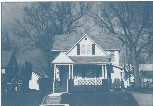
October 1934 - September 1935 First community library in Marge Herron's home 504 Sixth Street

In 1954, the library was relocated to a room in the new City Hall at 318 Fifth Street. Approval of a $77,000 bond issue allowed the Library Board to construct a separate facility in 1966. The prop-